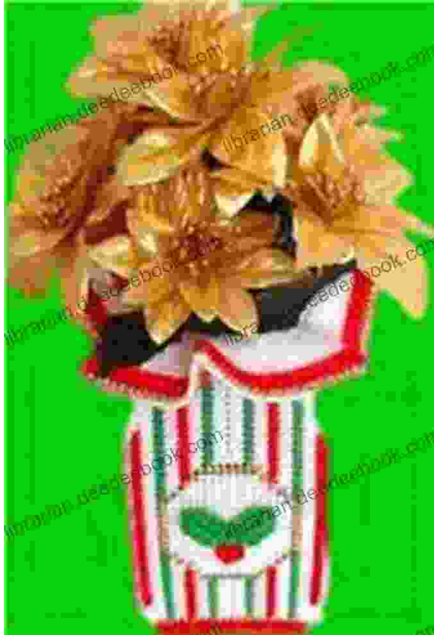
A plastic canvas Christmas holly vase pattern.