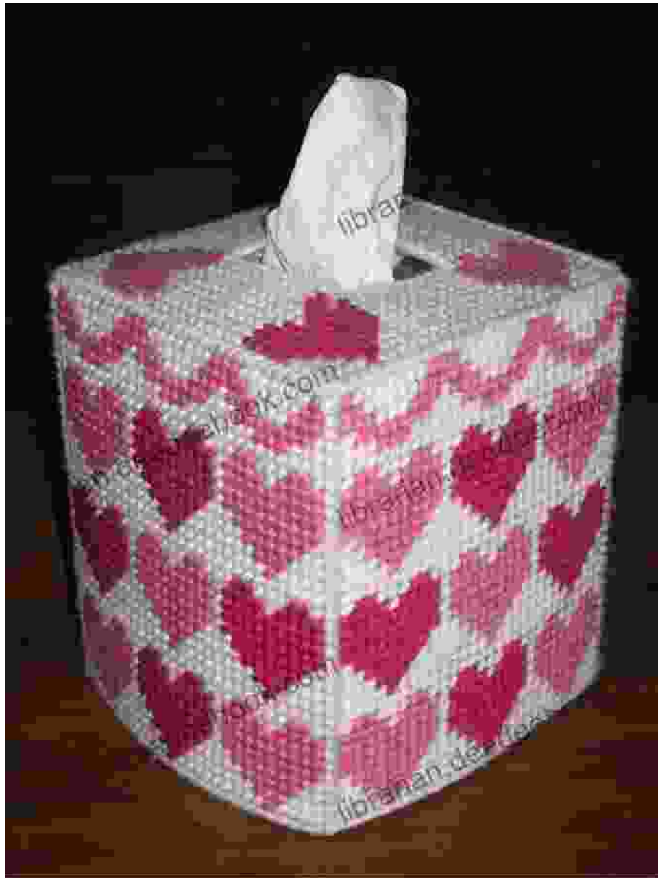
A completed Hearts and Flowers Boutique Tissue Plastic Canvas Pattern, framed and displayed.