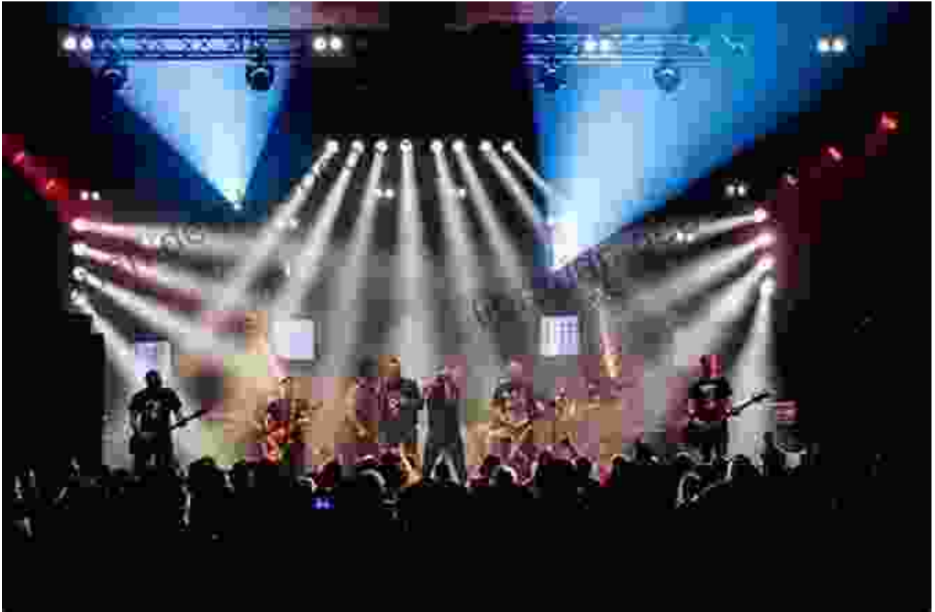
Image Description: A photograph of an ensemble performing on stage. The musicians are dressed in colorful and expressive attire, and they are playing their instruments with passion and creativity. The audience is engaged and attentive, and the atmosphere is filled with energy and excitement.